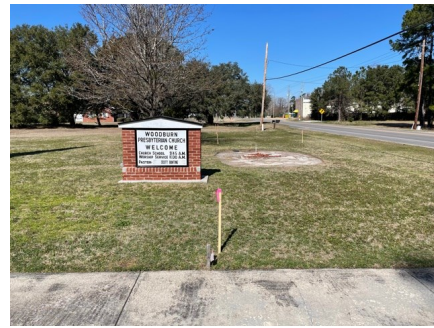
Flags have been installed marking the right of way the boundary of the right of way for Old Ville road.

The church had a few months to consider our options. It was decided that we would take the old sign down and re-construct a sign as it was built many years ago. Neil Schilling and a few others took on the task of demolishing the old sign and constructing a new one. It is now apparent that work will begin soon on widening the road and installing a new multi-purpose walkway and bike path. We do believe that this improvement will increase the safety of the area and allow for more foot traffic access to the church.