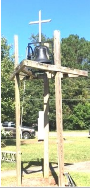
Just like our bell tower we are weathering the storm of COVID 19