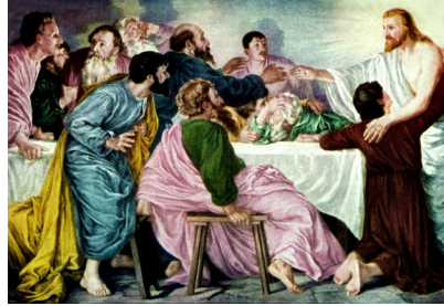
Disciples of Christ

and placed us in the exact place He wants us to grow our faith and make disciples. Making disciples can look different for each of us, but discipleship includes one common factor: relationships. You can’t disciple someone unless you have a relationship with them.